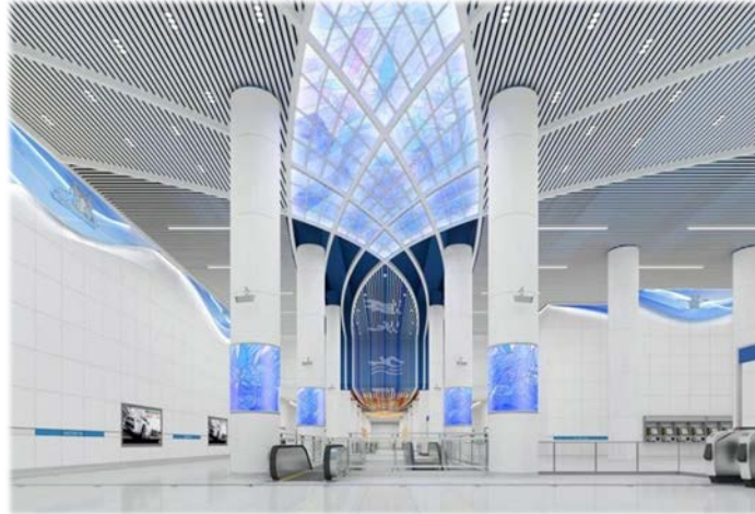
Figure 1 “Sports” theme shows dynamic Jinan.

refines the architectural elements of the Olympic sports center through the segmentation and color echo of the ceiling, and combines them with the elements of track and field and water sports field to form a symbolic language and create a space full of sports sense. One end of the platform is mainly cold color, reflecting water sports; The other end is mainly warm color, reflecting track and field sports; The sinking part of the center extends to both ends in the form of color bars, interspersed between the color bars, with symbolic sports elements, forming an overall design with subway public art works.